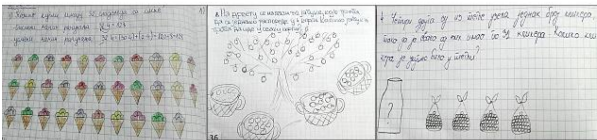
Figure 1 From student portfolios, problems with numbers 32 and 4.

The course was designed to focus their attention to studying structure of math problems. As a part of regular class activities they were encouraged to analyse problems in different math domains (arithmetic, algebra, geometry, fractions) and explore possibilities to create variations of them. Each week they were asked to pose problems. In some occasions they designed variations of problems found in math textbooks. In others, they were asked to pose own problem from scratch, fulfilling some requirement (problems of different levels of difficulty, problems set in specific real context, etc.). As they learned about representations in mathematics they were asked to create problems using different representations or to solve problem by using different representations. Their productions were part of portfolios assessed at the end of semester. For example, they were asked to pose a problem involving numbers 32 and 4. Students came up with simple problems of division and multiplication (Figure 1).